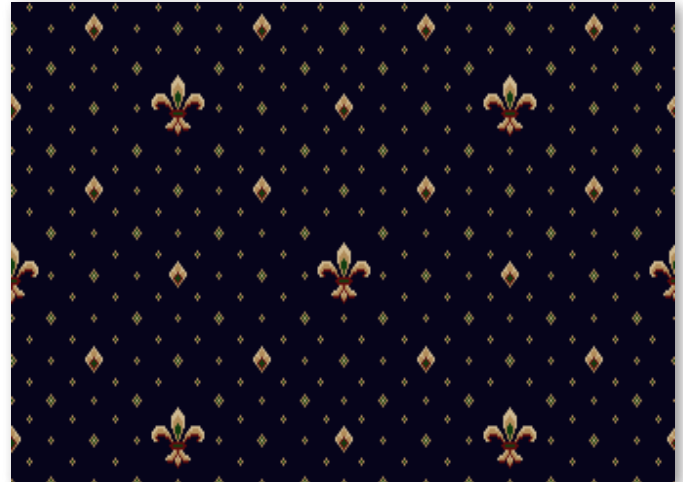
▲ Midnight 30