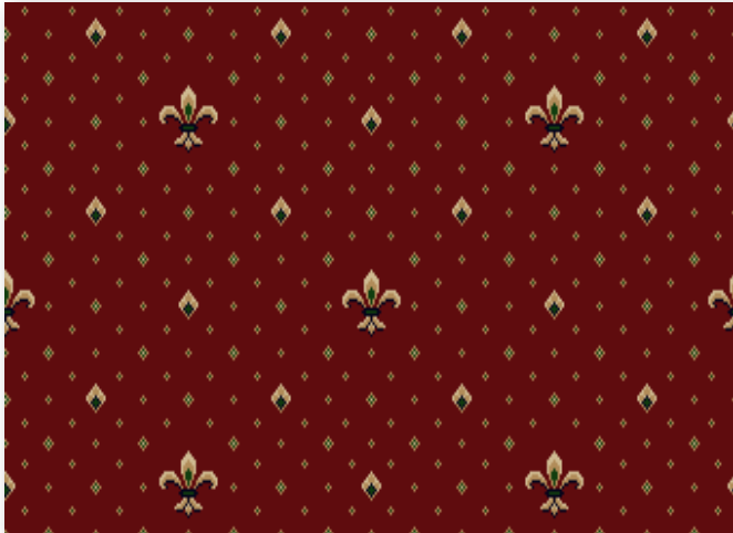
▲ Regel Red 10